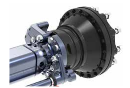
thanks to varying brake camshaft position.